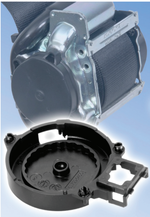
Bearing plate of safety belt retractor from Autoliv made of DuPont™ Delrin® 300TE